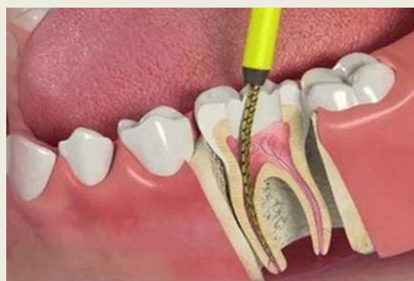
Fig.4 Root canal treatment

The mean total post-treatment pain in the articaine group was 25.4 \pm 26.4 , whereas it was 37.1 \pm 32.9 for lidocaine group. Therefore, the pain after RCT in the articaine group was significantly less than the lidocaine group, concluding that using articaine for IANB may increase post-RCT comfort better than lidocaine.