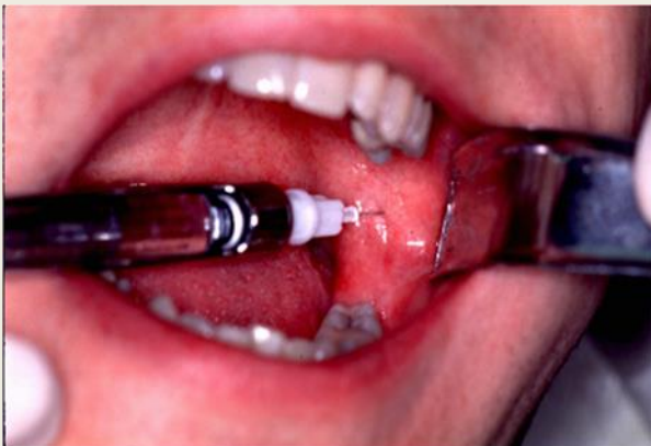
Fig.3 Inferior alveolar nerve block

The conclusion is that single anesthesia techniques (IANB or BI) were not able to achieve pain-free emergency endodontic treatment with both articaine 4% BI and lidocaine 2% IANB in an emergency RCT in patients with symptomatic irreversible pulpitis in mandibular molars. To increase the success rate supplemental anaesthetic techniques should be considered prior this specific treatment procedure.