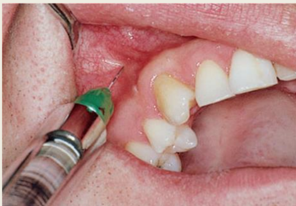
Fig.2 a maxillary buccal infiltration

block anesthesia but no advantage over lidocaine when used for mandibular block anesthesia alone or for maxillary infiltration.