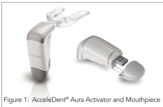
Figure 1: AcceleDent® Aura Activator and Mouthpiece

Activator and bites onto the Mouthpiece for 20 minutes a day during the course of orthodontic treatment. The device is lightweight and is intended to be held in place, retained solely by gentle bite pressure.