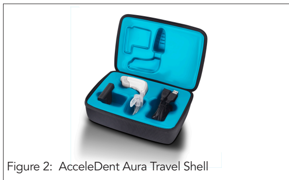
Figure 2: AcceleDent Aura Travel Shell

Patient compliance with AcceleDent Aura is typically excellent as it is used by the patient in the comfort of his/her own home. While it requires a full 20 minute treatment period each day, AcceleDent Aura is easily incorporated into other daily activities such as watching television, reading, and working on a computer. A USB Extension Cable with power adaptor allows for easy and convenient charging, and a Travel Case complements the portability of the system (Fig. 2). Additionally, the Activator records use of the system for the patient or the prescribing orthodontist who may be concerned about non-compliance by younger patients. The patient's usage history can be reviewed via the FastTrac Report (Fig. 3) by connecting the USB interface of the Activator into a computer.