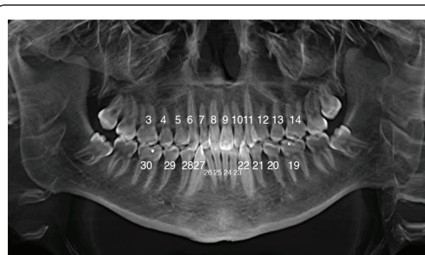
Figure 2 Notation of Teeth.

Measurements of all teeth present were made from the mesial buccal roots of the first molar on one side of the