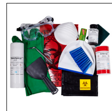
Master Spill Kit