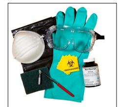
Mercury Spill Kit