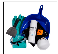
Chemical Spill Kit