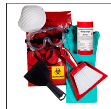
Biological Spill Kit