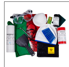
Master Spill Kit