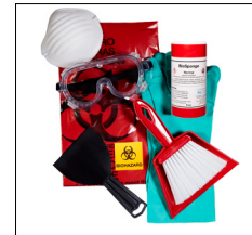
Biological Spill Kit