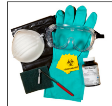
Mercury Spill Kit