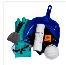
Chemical Spill Kit