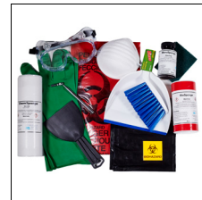
Master Spill Kit