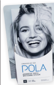
POLA PATIENT HANDOUT STAND