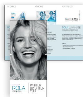
POLA PATIENT HANDOUTS

Contact your local representative to find out more.