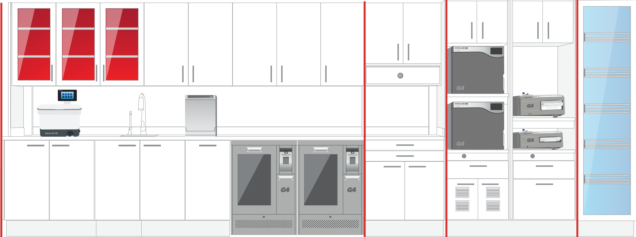
1 Receiving, Cleaning, and Decontamination

Minimize handling of instruments and increase staff productivity with improved efficiencies. Your office can have the fastest and safest instrument processing system possible to avoid delays and interruptions in work flow and to reduce the risk of staff injury.