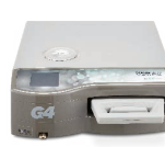
STAT/IM 2000 G4