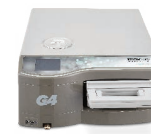
STAT/IM 5000 G4