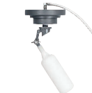
STAT/IM Auto Fill Kit